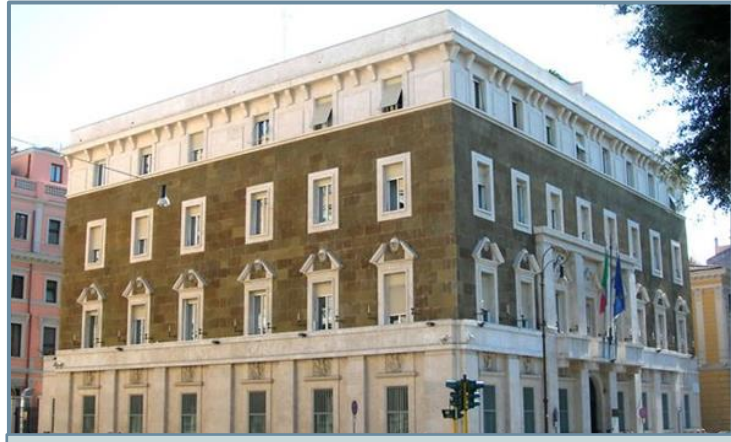
Consiglio Superiore della Magistratura at Piazza dell'Indipendenza, Rome, Italy

The Council for the Judiciary organisations are in various ways responsible for the support of the judiciary in the independent delivery of justice. Characteristic for all organisations is their autonomy and their independence of the executive and legislative power. Although there are different structures for ensuring judicial independence all Councils nevertheless are governed by the same general principles. Some Councils are competent with regard to career decisions for judges, selection, recruitment and evaluation and disciplinary actions whereas other, in general more recently established Councils have competencies that include policy and managerial tasks in the fields of efficiency and quality, budget and budgeting procedures.