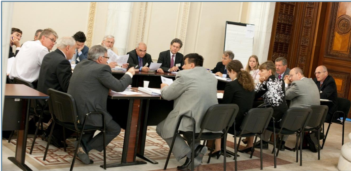
ENCJ in discussion