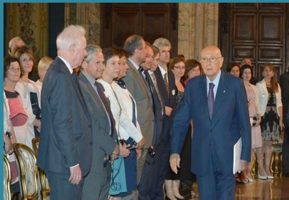
Opening reception of the 2014 General Assembly in Rome hosted by President Napolitano