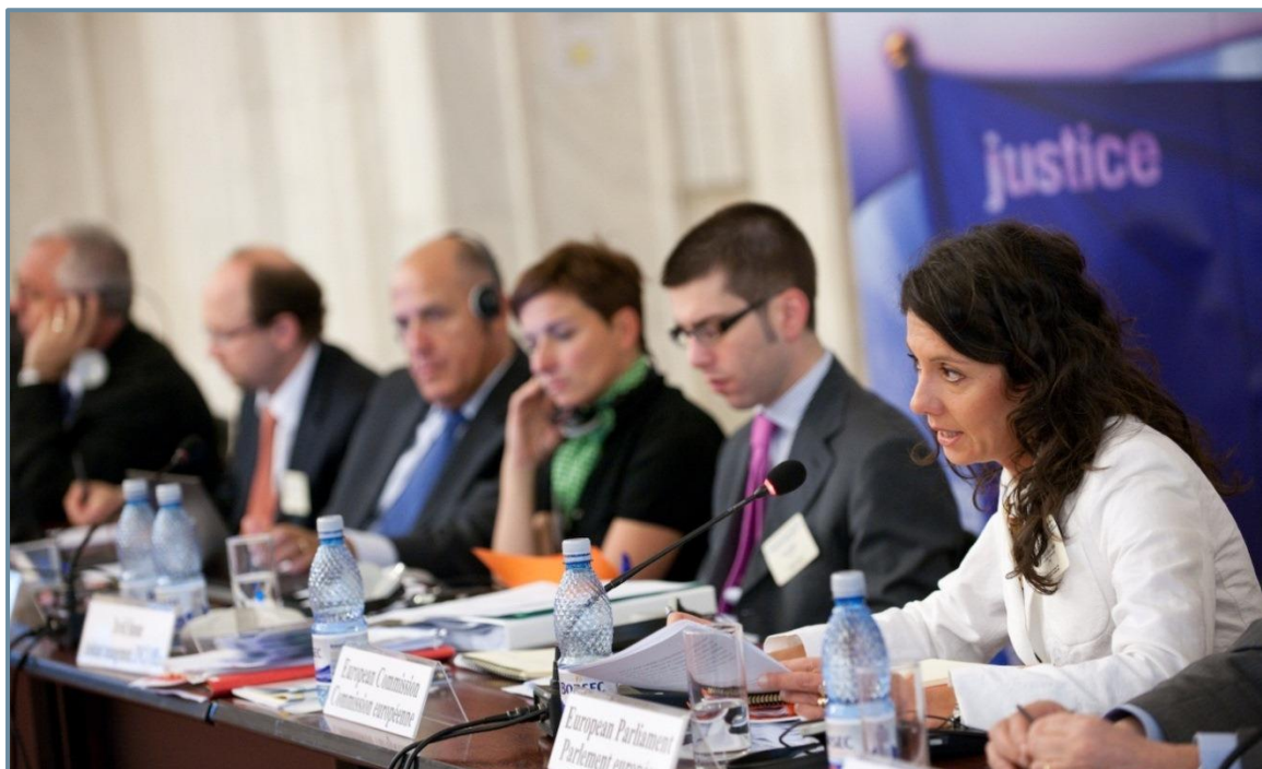
The European Parliament taking the floor at the ENCJ General Assembly in Bucharest

The ENCJ can look back with pride on its achievements since its formal establishment and looks forward with new ideas in continuing its role in furthering the common area of justice for the benefit of all citizens.